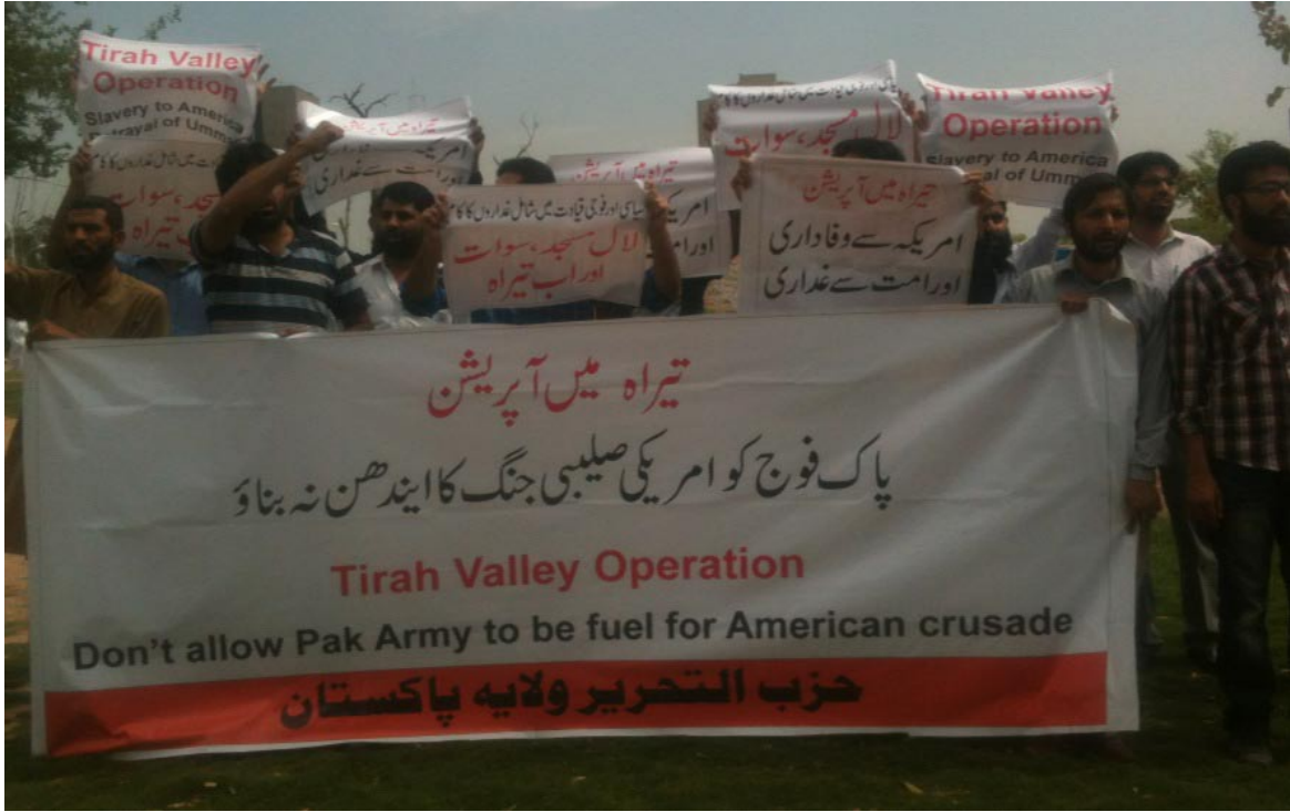
Islamabad: Members of Hizb ut-Tahrir Wilayah Pakistan protesting against Tirah Valley Operation