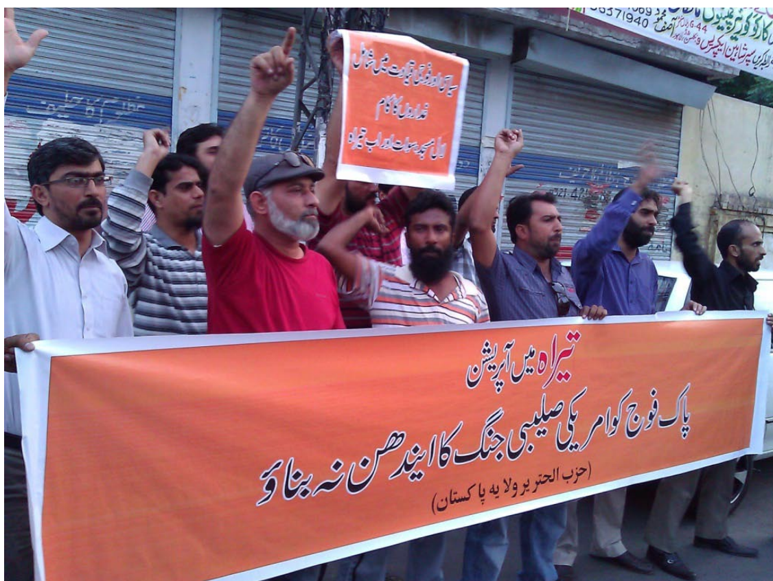
Lahore: Protestors chant slogans against the civilian and military leadership for their treachery