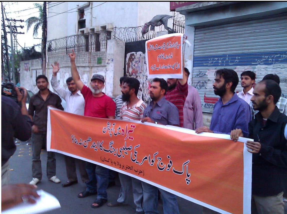
Lahore: Members of Hizb ut-Tahrir display banners and placards against Tirah Valley Operation