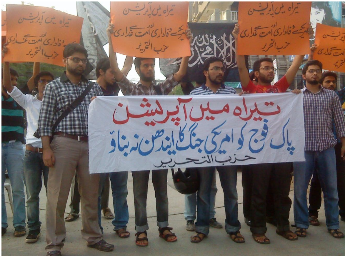
Karachi: Protestors demand that Pakistan's Army should not be used as fuel for the American War